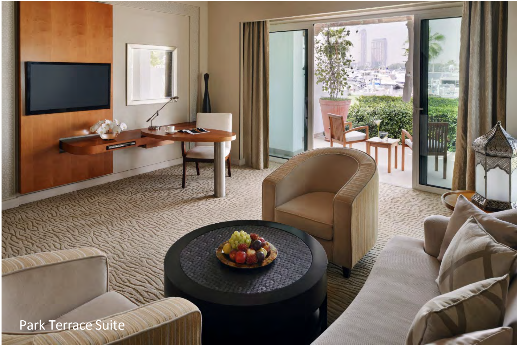
Park Terrace Suite