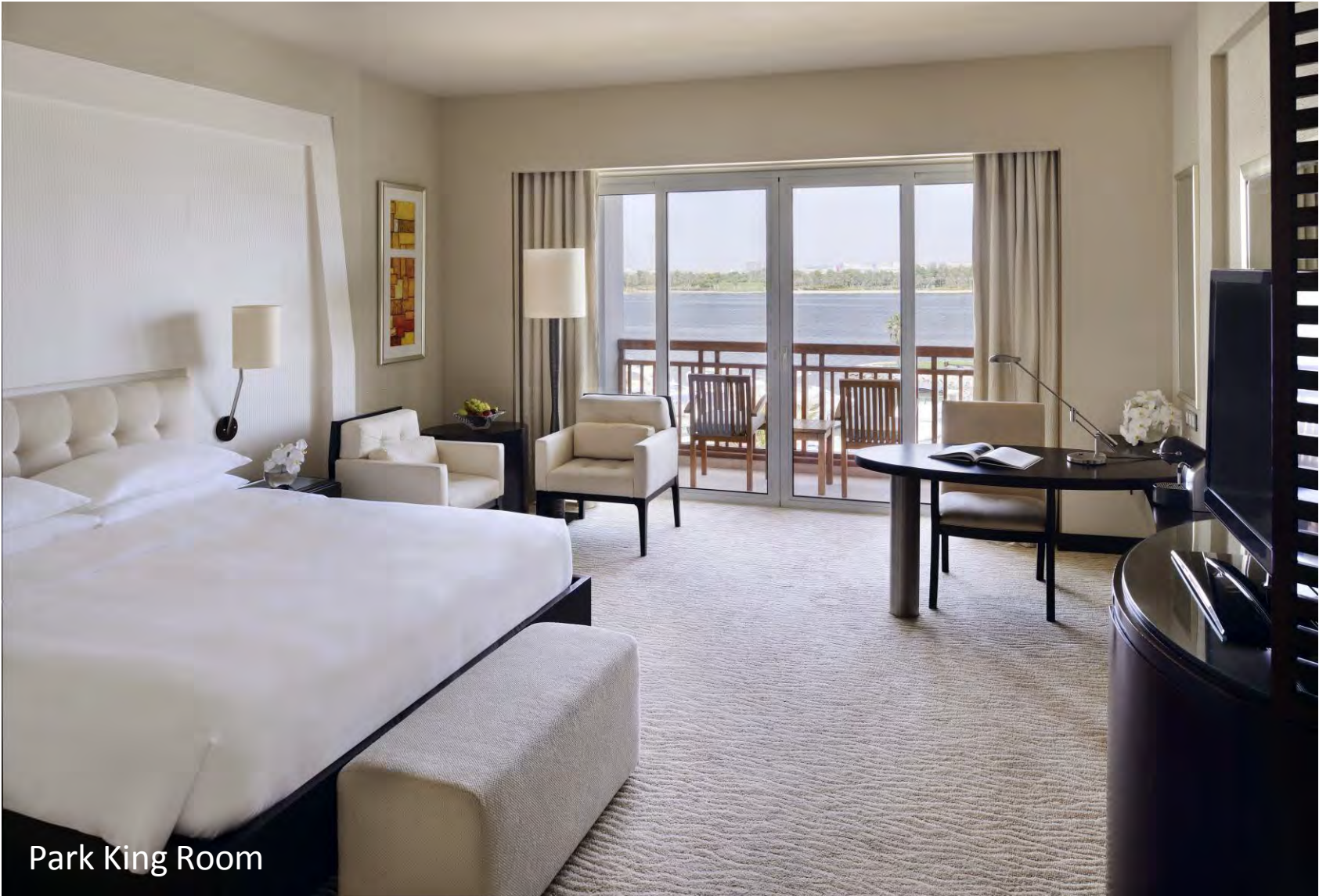
Park King Room