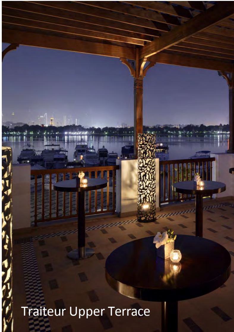
Traiteur Upper Terrace